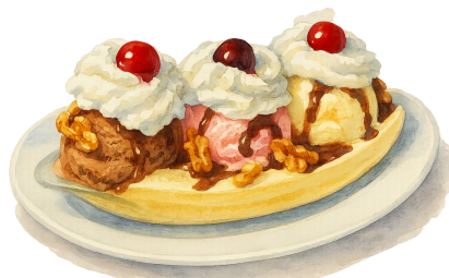
BANANA SPLIT $14