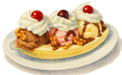
BANANA SPLIT $14