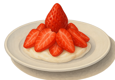
STRAWBERRIES & CREAM $12

DISHES SPLIT NO MORE THAN TWO WAYS | 2 CREDIT CARD MAX PER TABLE